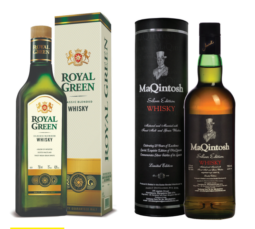
ADS Spirits' Royal Green whiskey (L) was identified as the fastest-growing Millionaire whiskey brand in the world. Amrut Distilleries' MaQuintosh (R), launched 30 years ago, is going Super-Premium with pan-India distribution.

inroads into the territories of Blender's Pride (Pernod) and Signature (Diageo).