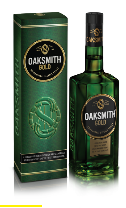
Oaksmith and Oaksmith Gold, with unique blends of Scotch malt and American bourbon, are a critical launch for Beam Suntory India. They form an integral part of the company's aim to reach US$ 1 billion in sales by the year 2030.

Oaksmith, Rockford, Hawkston, Sterling Reserve B7 and B10, Royal Green, Rockdove, Golfer's Shot... The list gets longer if we consider local and regional whiskey brands.